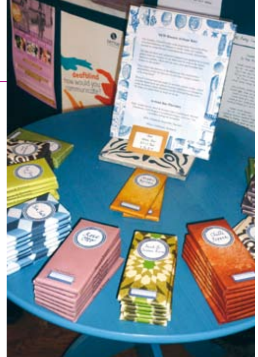
SHIVA KUMAR THEKKEPAT

benefits of chocolate over other desserts. “Chocolate is most definitely healthy, but it does need to be good chocolate, of course, and eaten in small quantities,” she advises. “Milk chocolate is not supposed to be easy to digest, as the milk bonds with the nutritious bit of the chocolate. Dark chocolate has much to recommend it – it’s packed full of vitamins, minerals and trace elements, naturally high in polyphenols and anti-oxidants, and you only have to research it to see all the scientific papers to prove this. Most commonly known are the beneficial effects on the cardiovascular and immune system, but also there is a marked effect on muscle and brain performance, both in stimulation and acting as an anti-depressant. Most doctors would recommend it in a similar way to aspirin. But remember, less is more.”